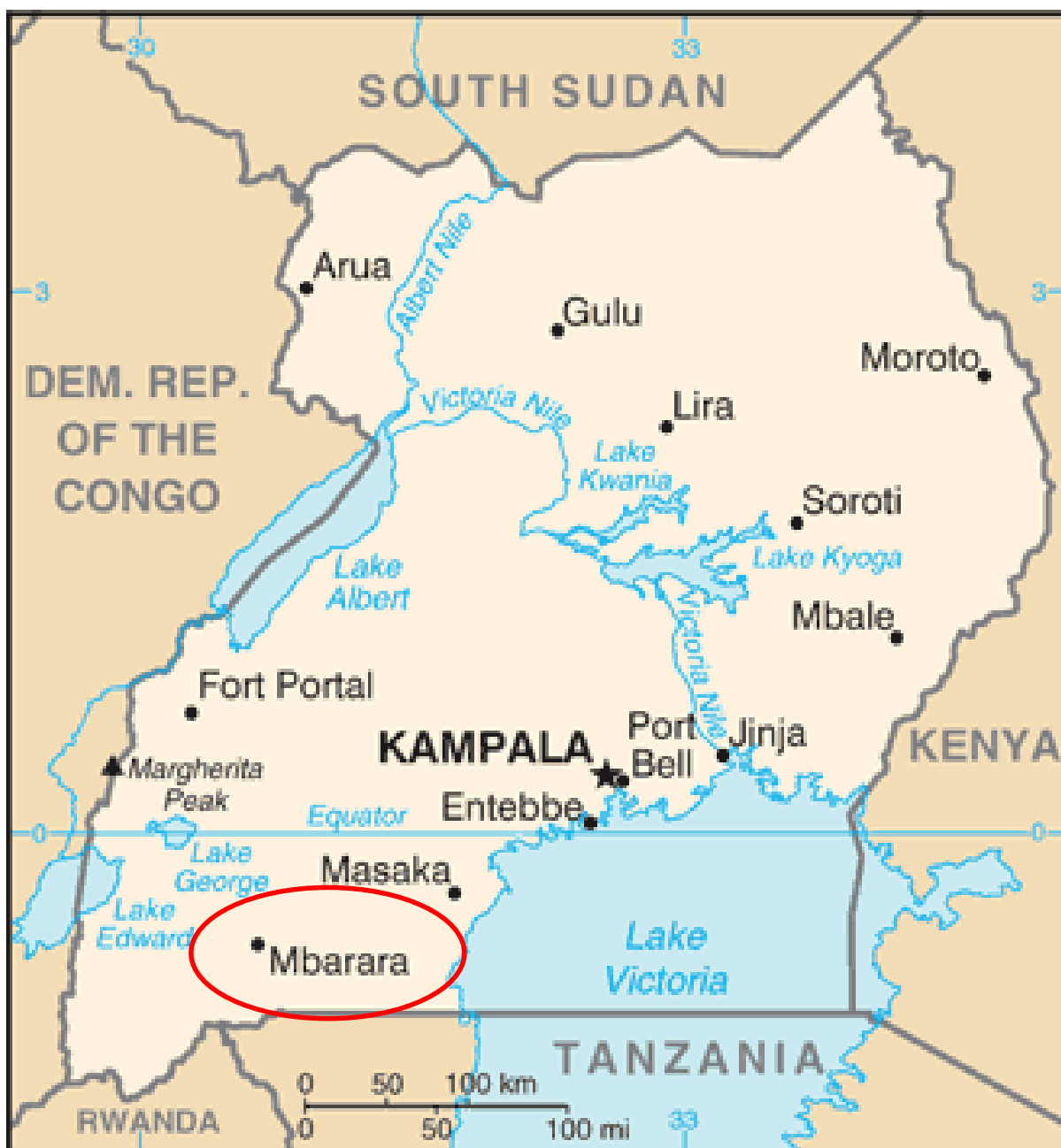
Figure 1: The map of Uganda showing the location of Mbarara District